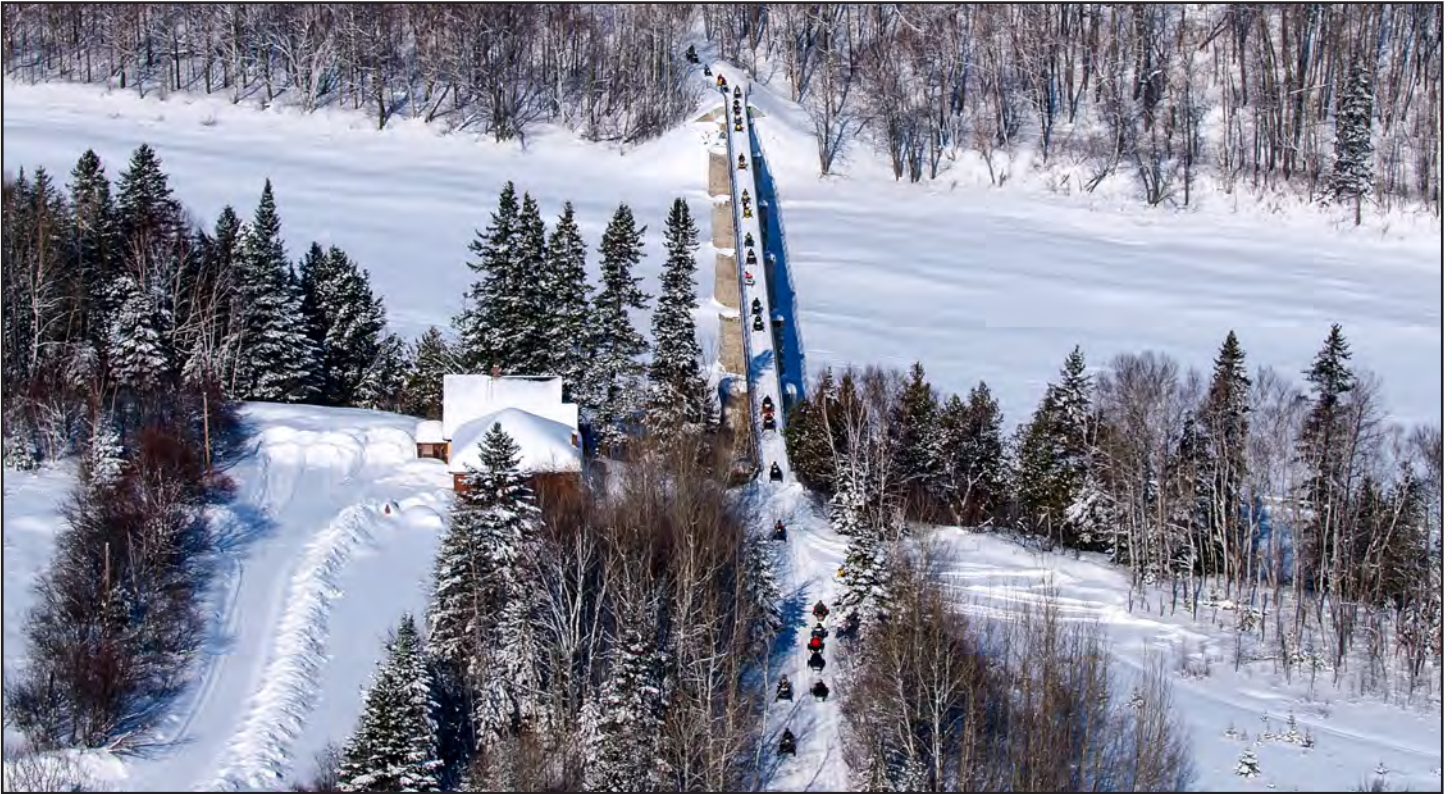
Snowmobiling on Maine's Aroostook Valley Trail