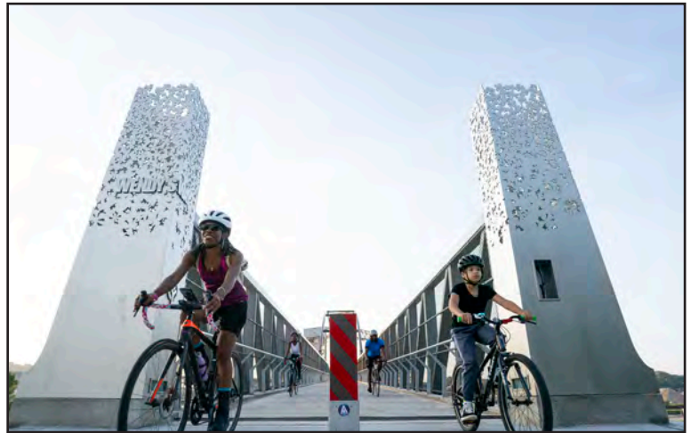
Ohio's Cleveland Foundation Centennial Lake Link Trail

ODOT has taken advantage of this eligibility with the state's Offices of Local Programs and Safety, agreeing to fund Bicycle and Pedestrian Facilities and Safe Routes for Non-Driver projects with 80% TA funds and 20% safety funds. This funding will be available for the Construction Contract and the Construction Engineering phases of the projects only. The costs associated with Design and Rights-of-Way must still be borne 100% by the applicant.